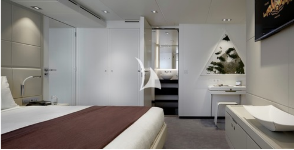
Double guest cabin