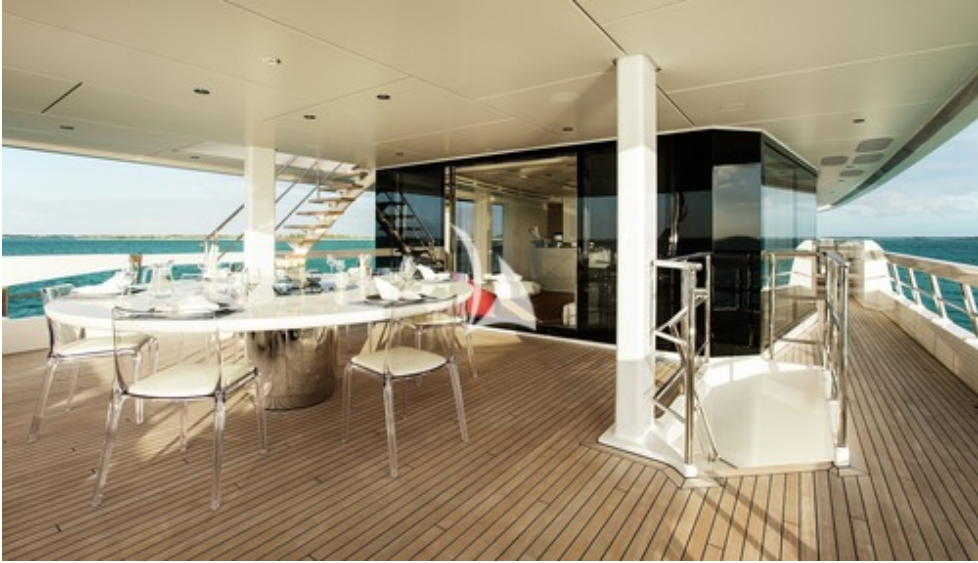
Bridge deck dining