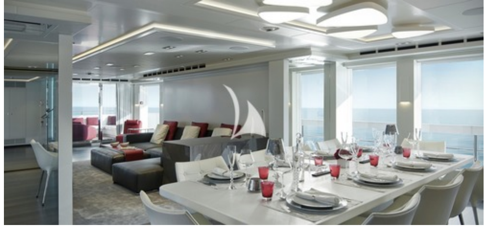
Main deck dining and lounge