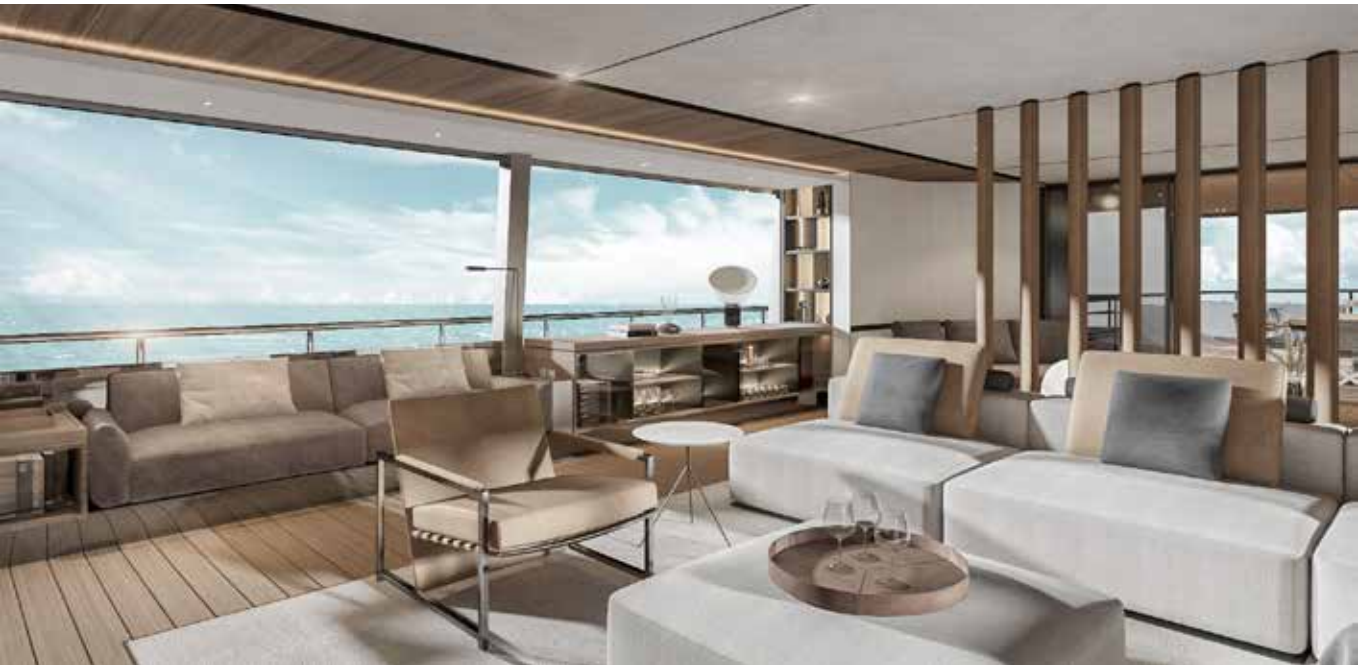
BRIDGE DECK | SALON