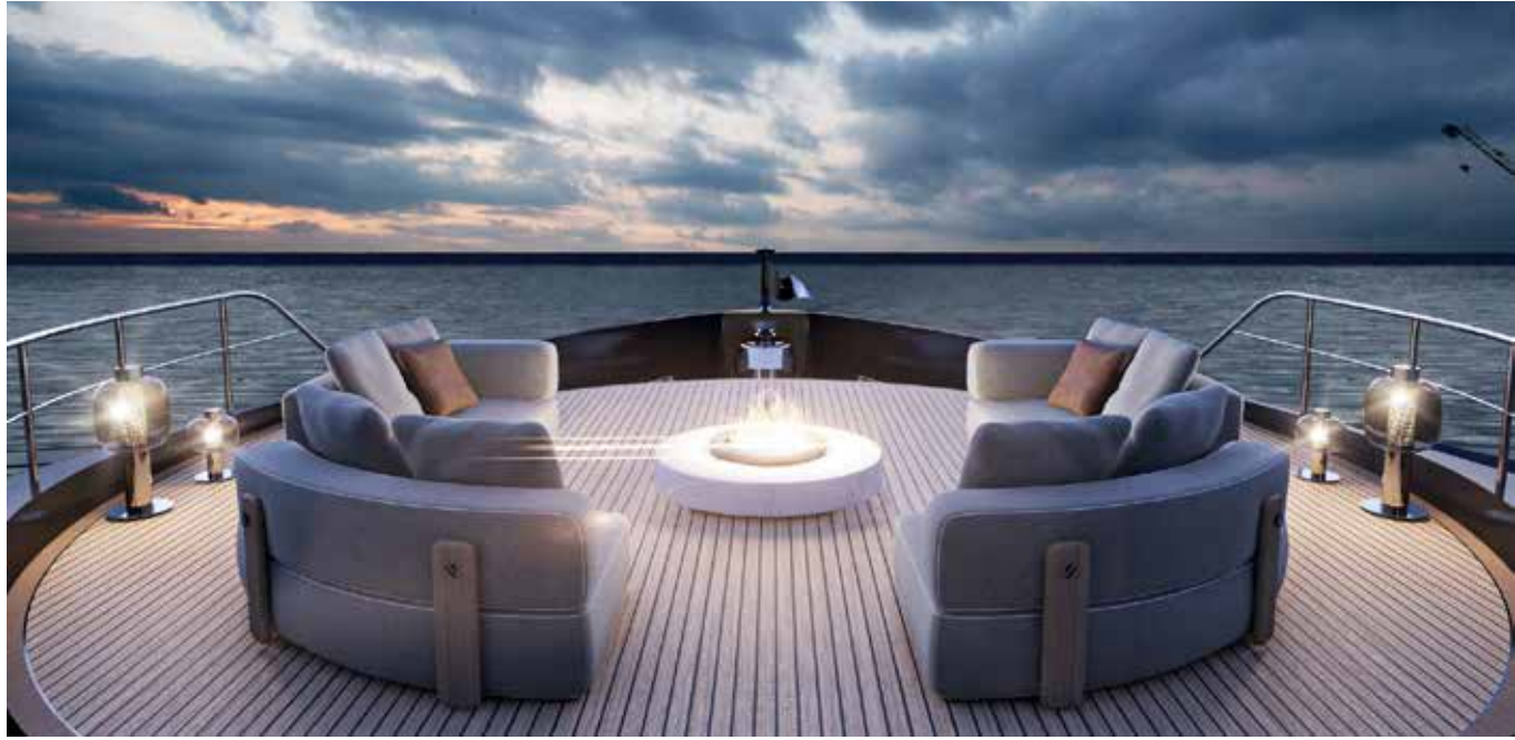
BRIDGE DECK | FORE DECK