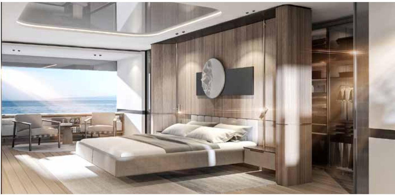
MAIN DECK | MASTER CABIN