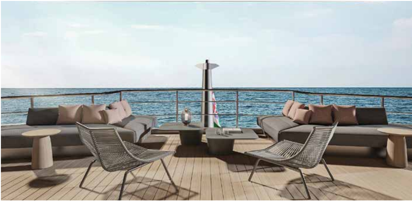
BRIDGE DECK | EXTERIOR