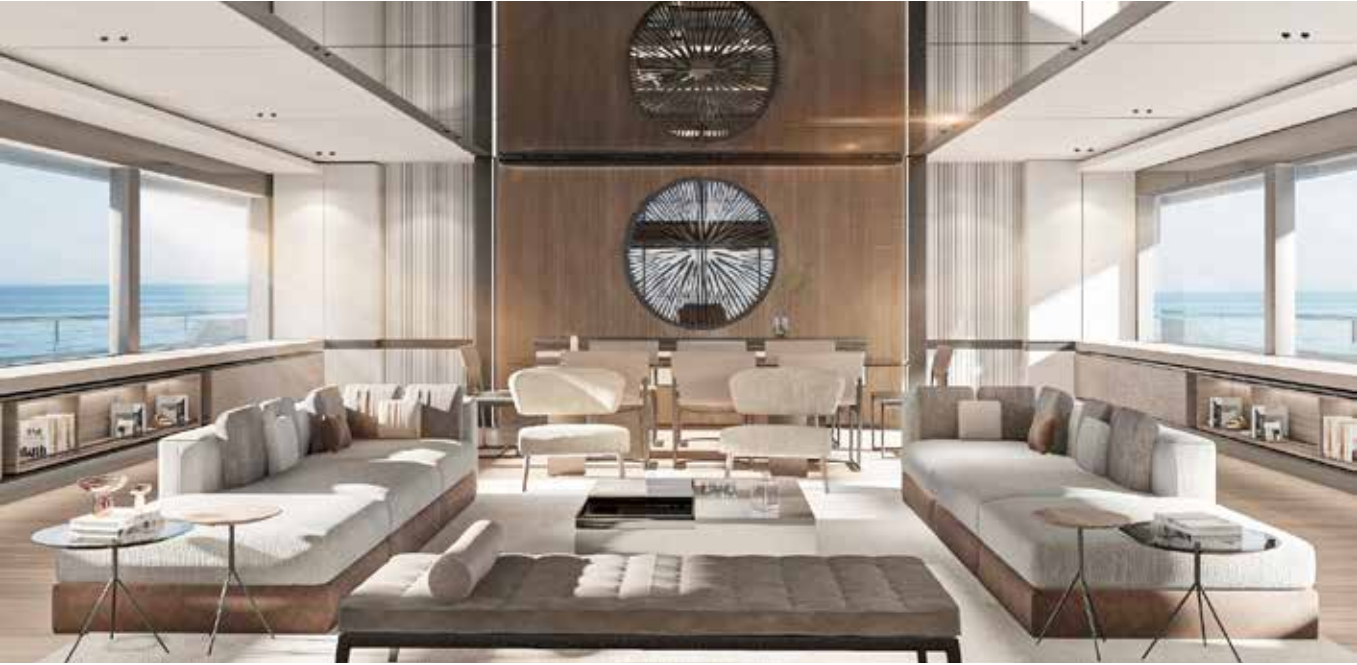
MAIN DECK | MAIN SALON